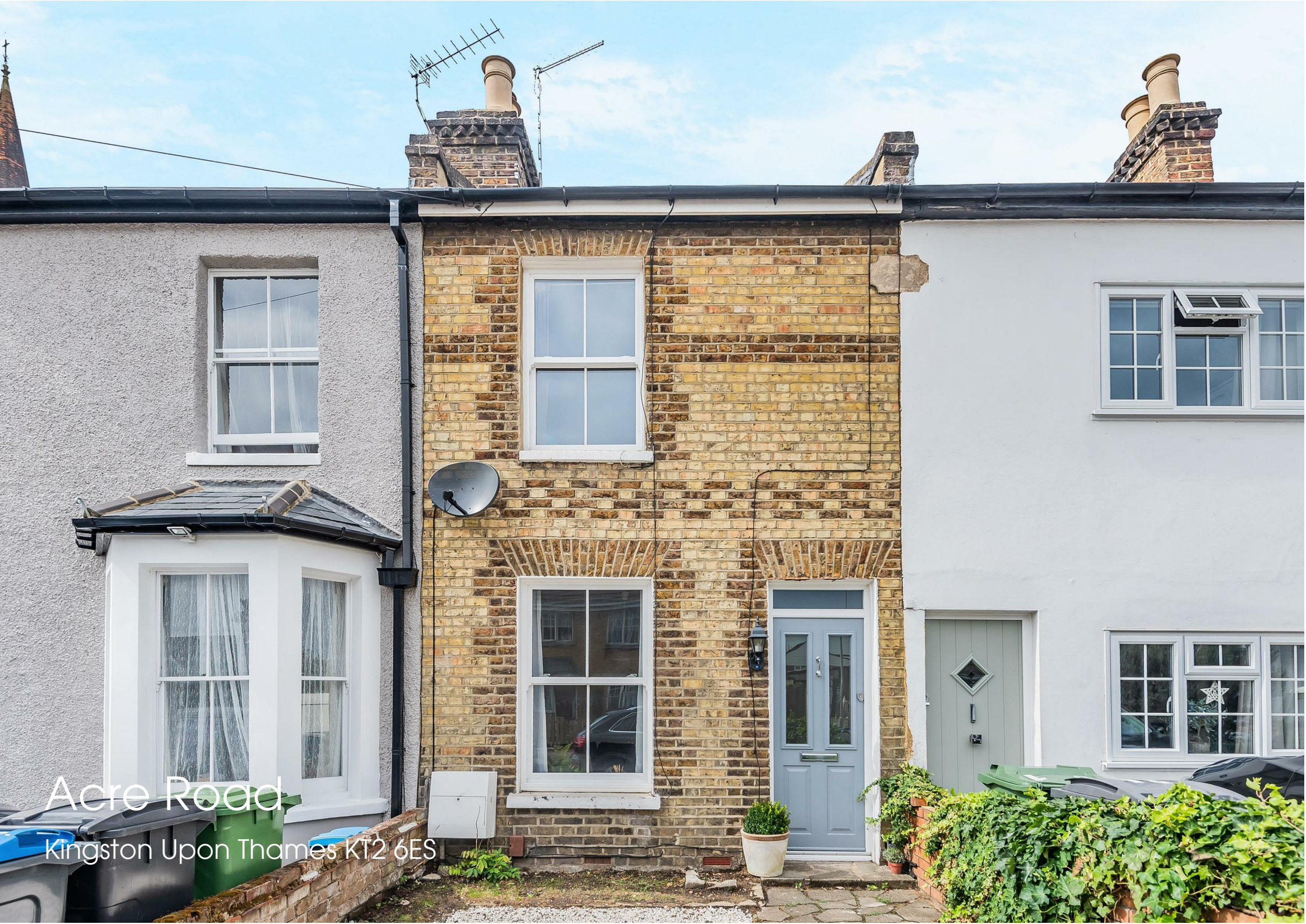
Acre Road Kingston Upon Thames KT2 6ES